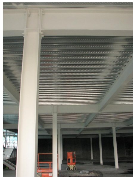
Freshly applied fireproofing coatings in a hospital construction.